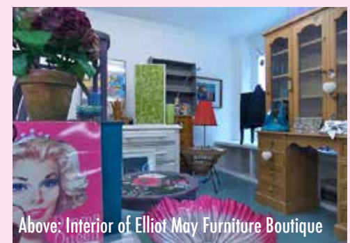
Above: Interior of Elliot May Furniture Boutique

A unique selection of gifts and cards are also available at Elliot May making it a convenient place to stop for that special something.