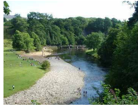
Bolton Abbey Estate