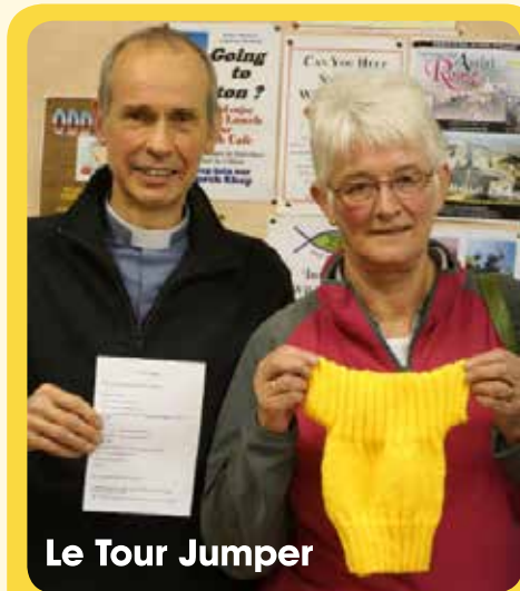
Le Tour Jumper

Work in yellow, double knitting, size 8 (4mm) needles