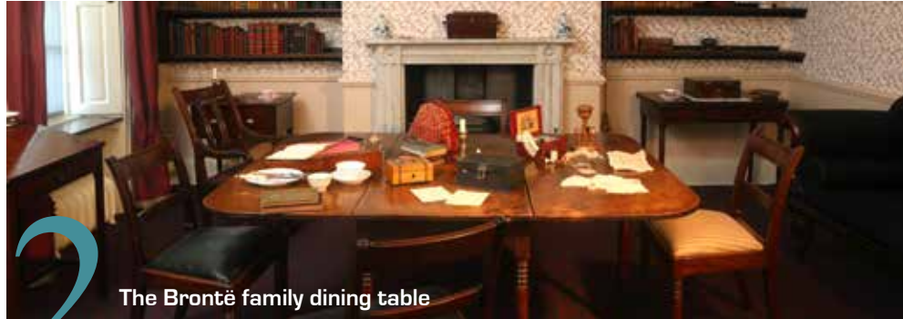
The Brontë family dining table

The importance of writers' tables to literary history is indisputable and in the Brontë Parsonage's collection is a table like no other. Without context, it is a normal looking, mahogany, drop-leaf table. But the well-loved, ink-stained table is not normal. Within the Parsonage, at the edge of the wild Yorkshire moorland, Charlotte, Emily, and Anne Brontë gathered at their dining table and wrote several of the most iconic novels in the world.