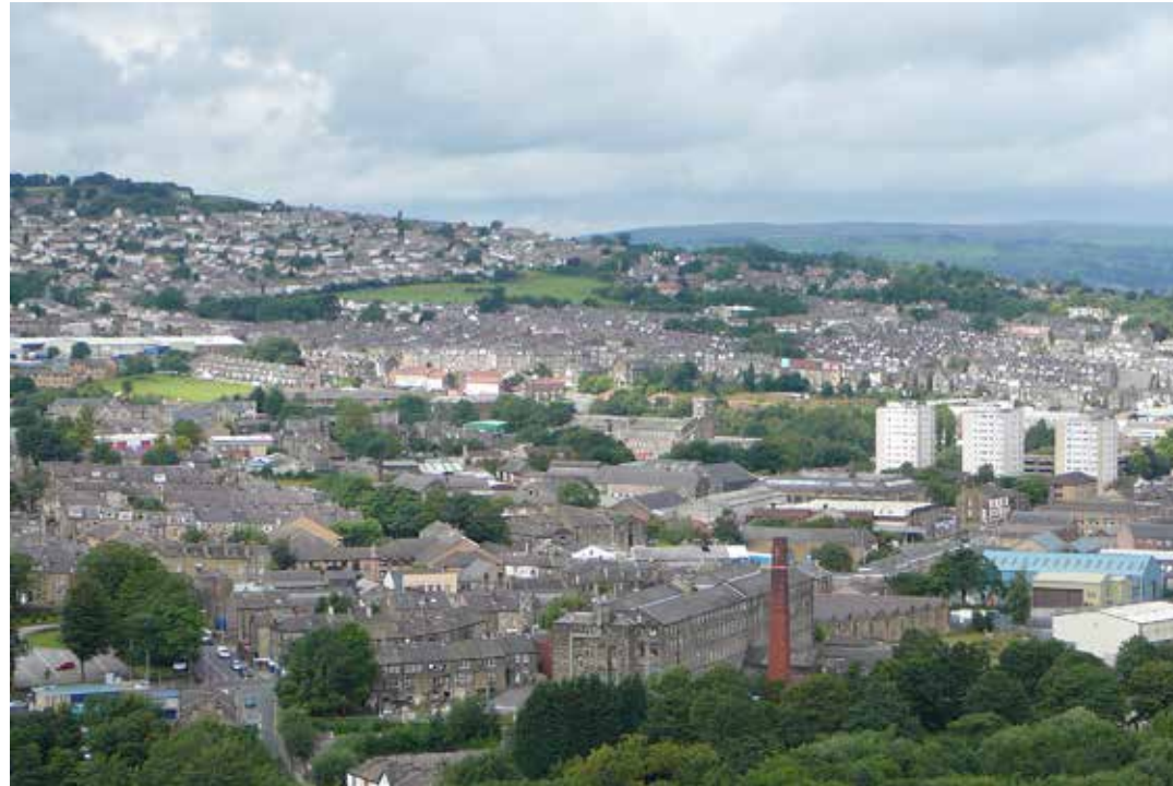
View of Keighley

Airedale Enterprise Services, Keighley’s local enterprise agency will deliver the project in Keighley & Bradford Council will