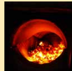
Stoke the fires!

The YPG warrants mention in itself: this is a carefully-supervised group for 13-15 year old volunteers, which prepares them for joining as an adult volunteer in a variety of roles, including 'permanent way' (maintaining the track), the locomotive and rolling stock departments (repairing as well as helping to crew the engine when old enough), stations duties, catering and tour guiding. Our challenge is to make sure that we pass the knowledge and experience down through the generations to ensure we have the expertise in future decades. With this in mind, we intend to refurbish our engineering and storage areas at Haworth, which will give us a better training facility, and also give us a better viewing area for visitors, who currently get to see very little of the magic that happens in Haworth shed, where our volunteers breathe life back into 100+ year old steam locomotives, and have done since the first steam locomotive