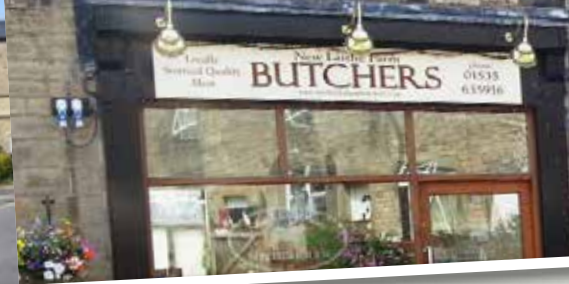
Some of the numerous shops in the village . Shop Local Cross Hills is made up of independent retailers and service providers.