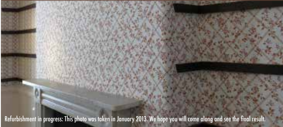
Refurbishment in progress: This photo was taken in January 2013. We hope you will come along and see the final result.