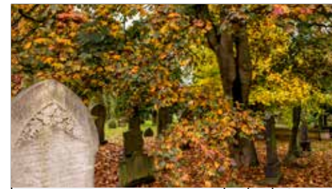
Fallen

November remembers and tips its hat to sorrow and joy.