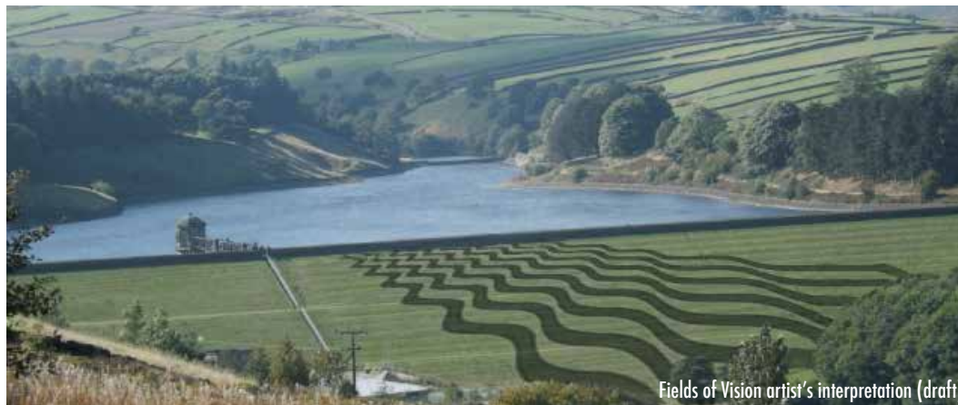
Fields of Vision artist's interpretation (draft)

It's been a landmark month on the Worth the Tour calendar – not least with the