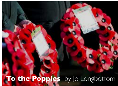
To the Poppies by Jo Longbottom

Hail scarlet sentinels, After harvest hail. Left beside the stubble and the stacks Frailest petals, Boldest reds and blacks. Blow Autumn winds your petals back, Yet still you stand, you nod, you bow. Sunset never can out-red your face. Not now, At harvest.